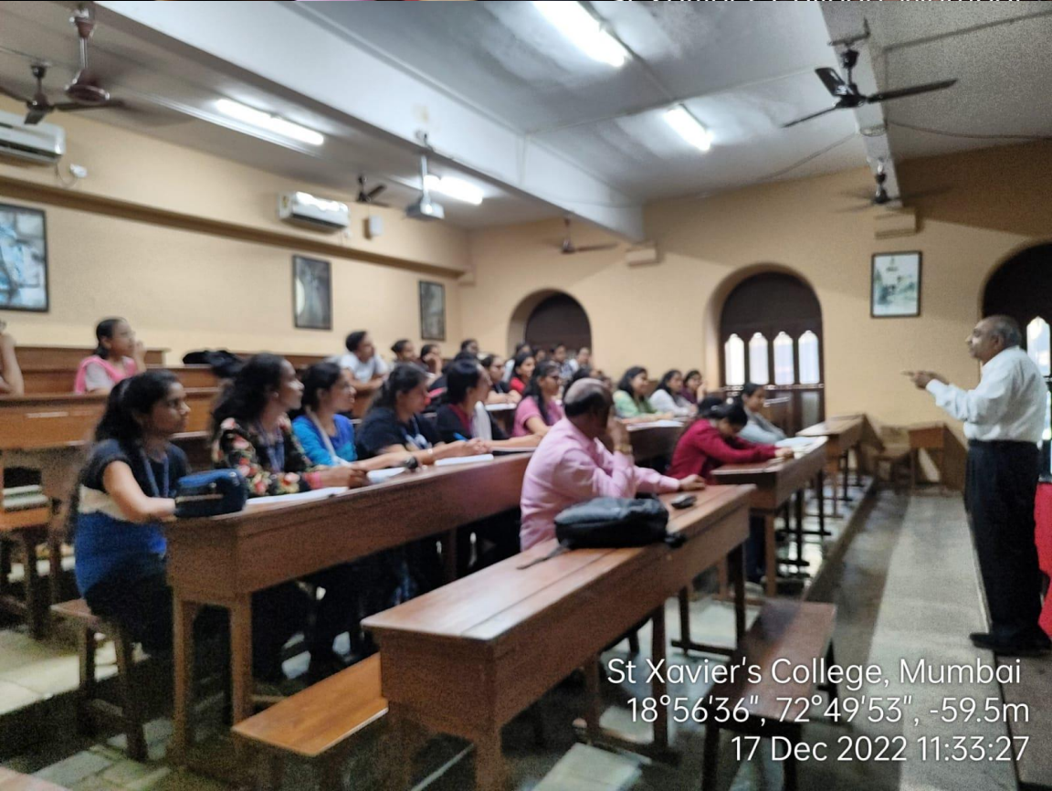
St Xavier's College, Mumbai 18°56'36", 72°49'53", -59.5m 17 Dec 2022 11:33:27